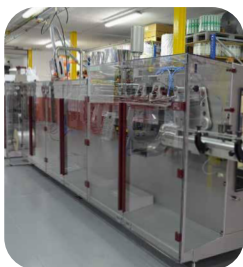
SANITARY DESIGN FRAME