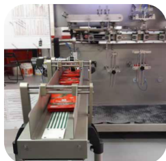
POUCH INFEED BELT

Compact, robust design, and inline operation, with easy access to all mechanisms, are highly appreciated in the food, chemical, pet food and beverages industries. Autoclave "retort" applications are also our expertise, by offering a reliable equipment that guarantees sealing integrity.